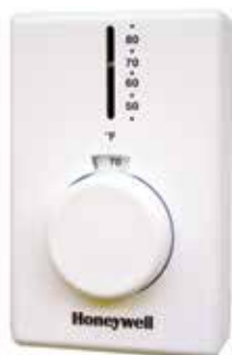
T4398A 1021 Precision Mechanical