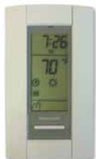
TL8230A 1003 Electronic Programmable