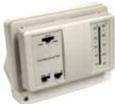
RFT-1 shown with UT thermostat