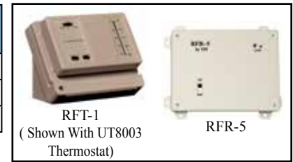
RFT-1 (Shown With UT8003 Thermostat)

* Can be used with Hotpod models as a noise attenuator