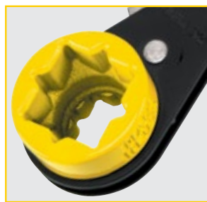
3/4", 13/16", 1" & 1-1/8" combination square socket