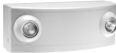
30 Watt Capacity with deep housing