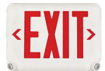
EVC Combo Exit/ Light