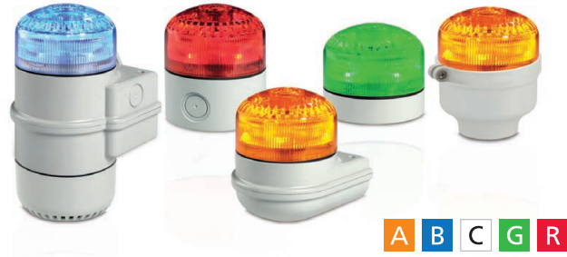
Model SLM500 shown with mounting base options (ordered separately)