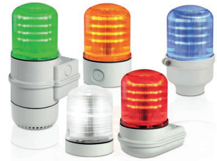
Model SLM100 shown with mounting base options (ordered separately)