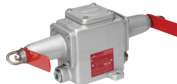
AFU0333-66 Double End